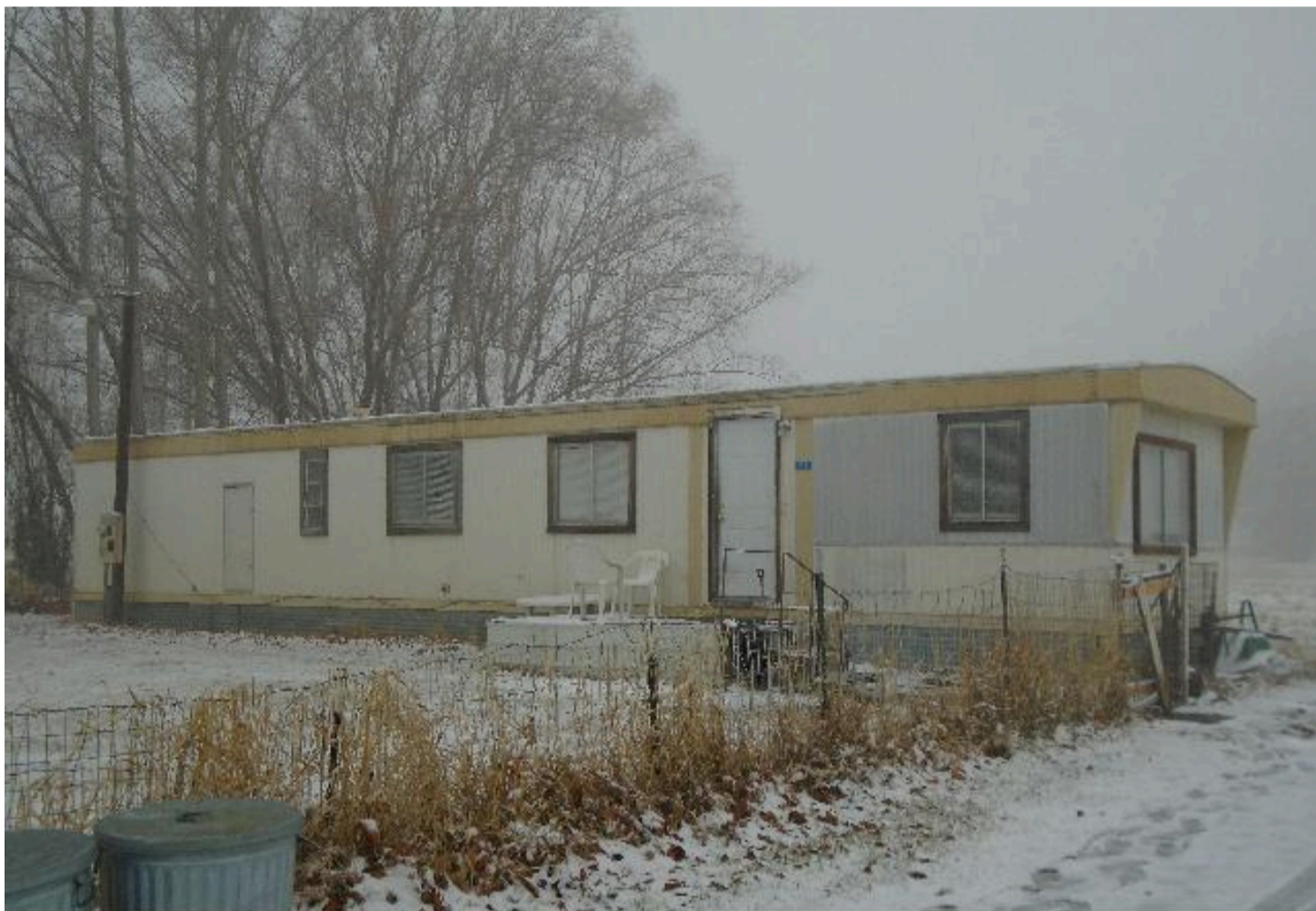
91 TREPANIER CT COWICHE, WA 98923