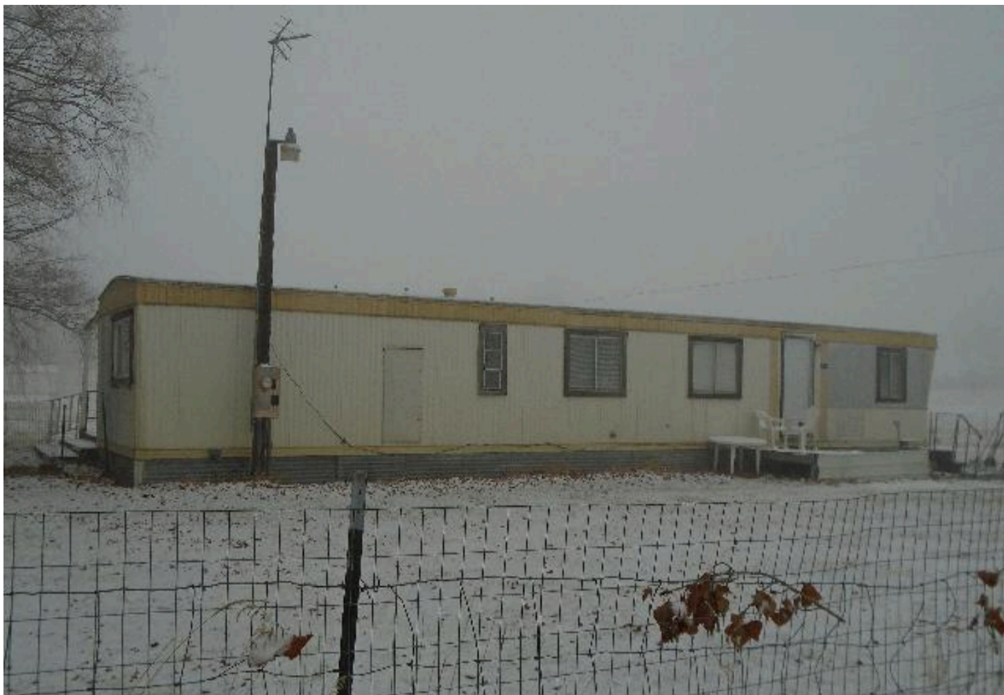
91 TREPANIER CT COWICHE, WA 98923