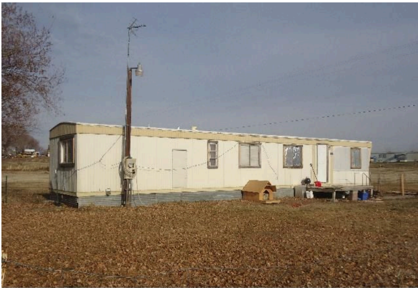
NACHES HEIGHTS/RUDD , WA