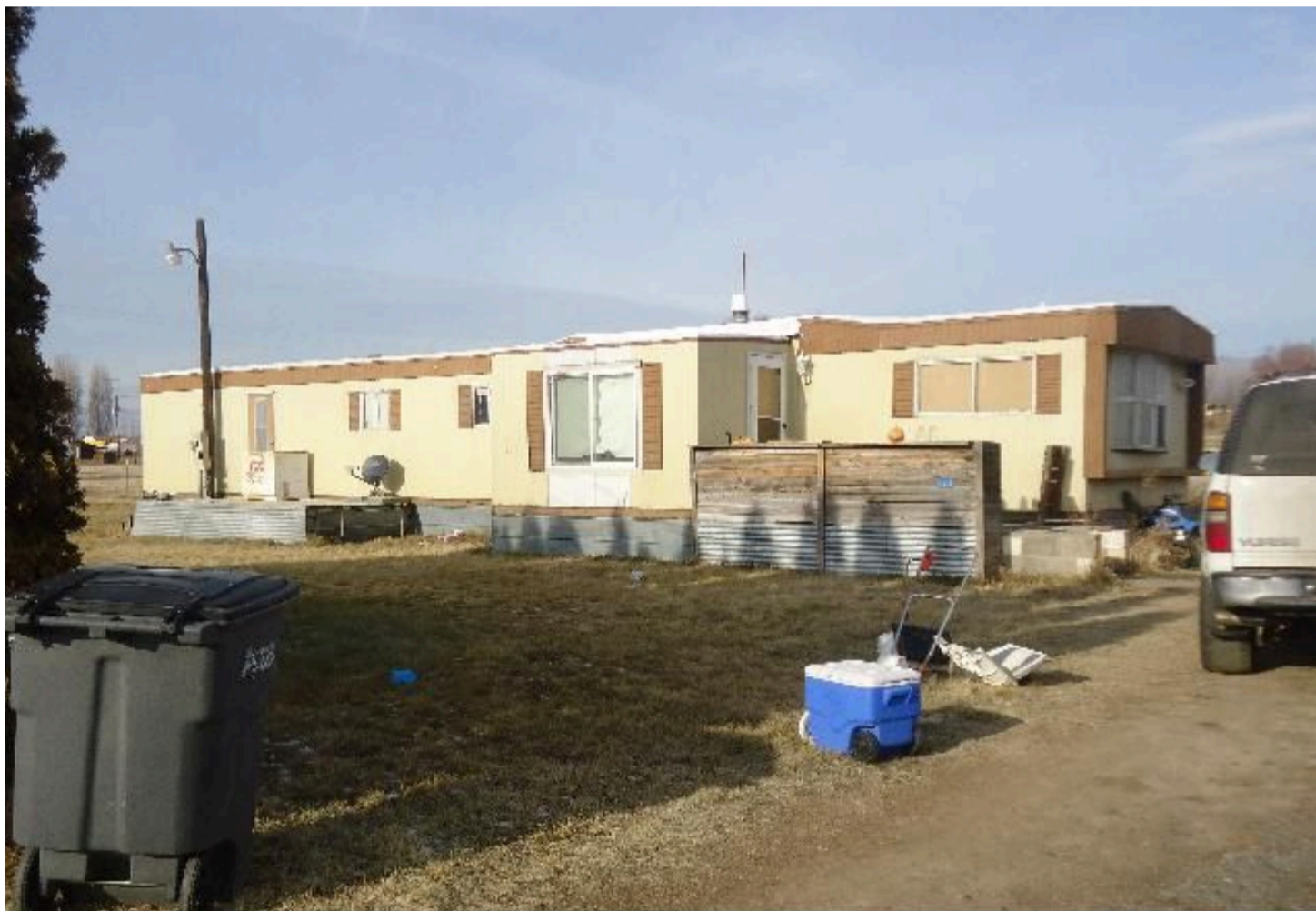
NACHES HEIGHTS/RUDD , WA