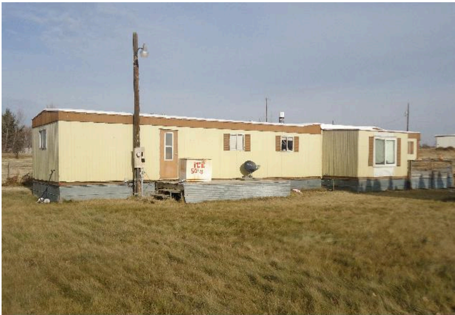
NACHES HEIGHTS/RUDD , WA