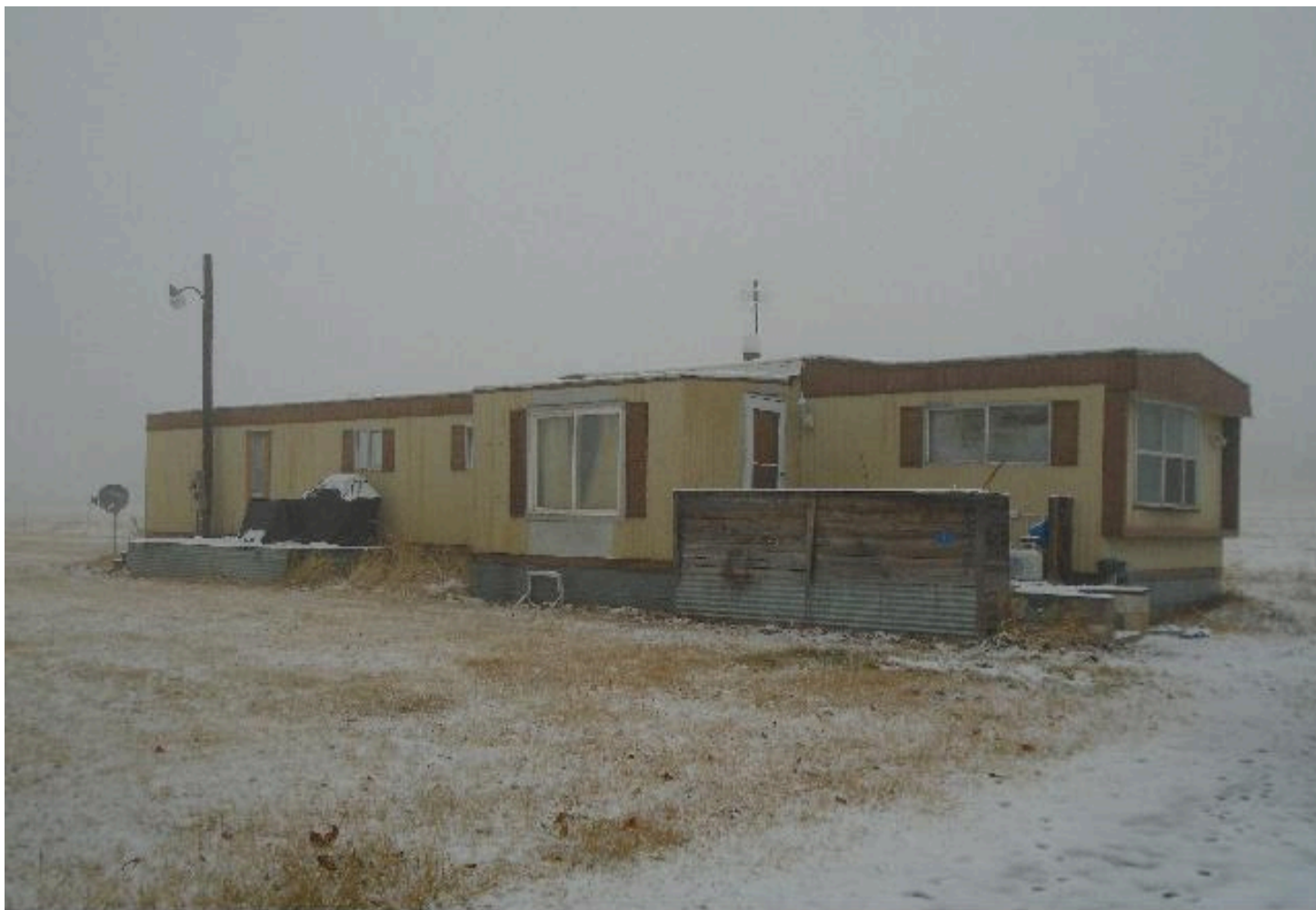
NACHES HEIGHTS/RUDD , WA