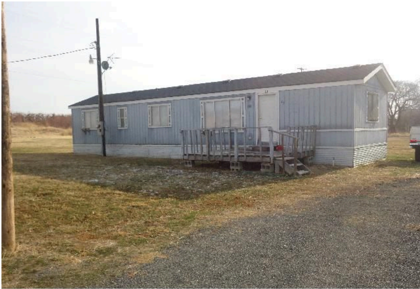
170 TREPANIER CT , WA