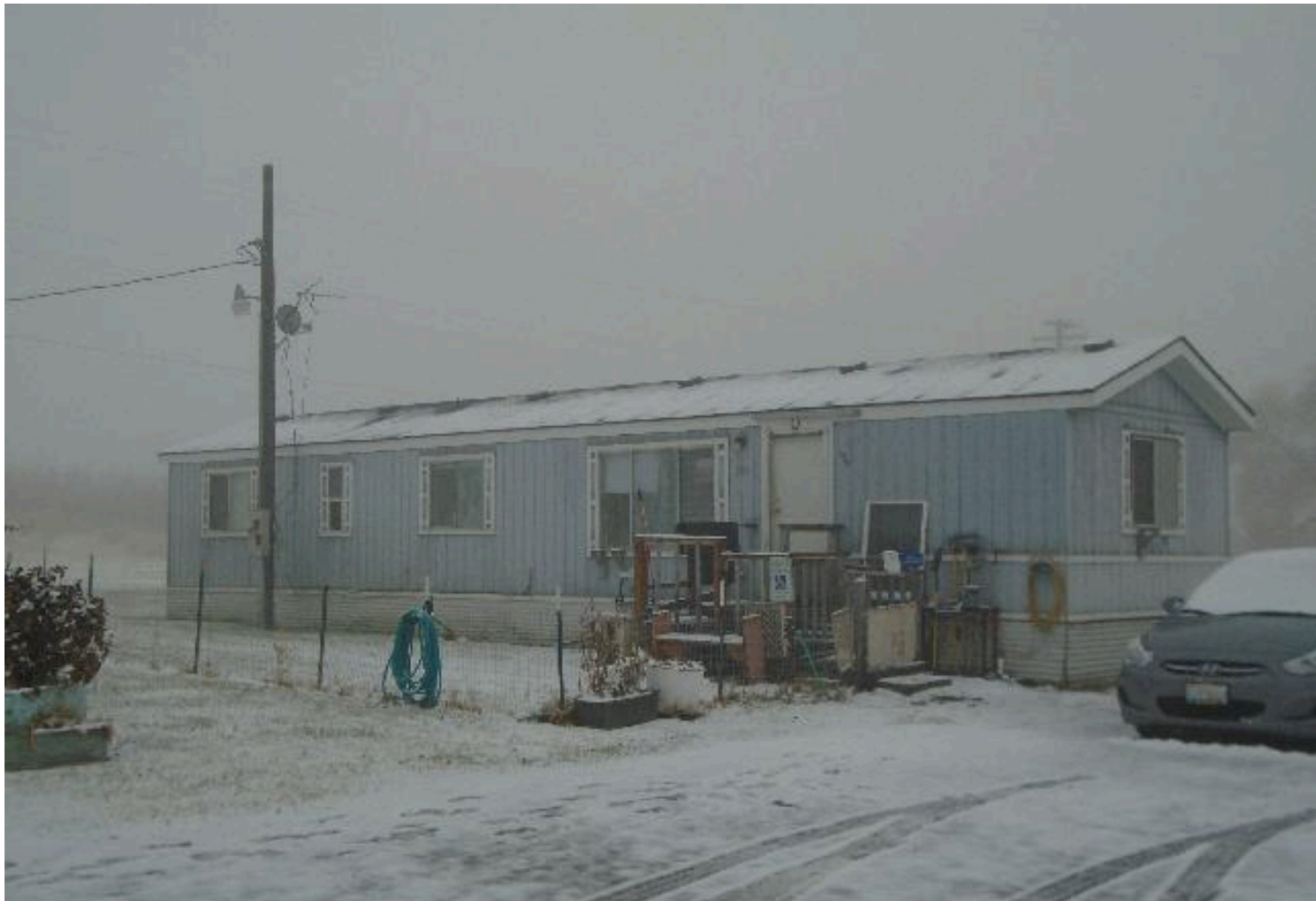
170 TREPANIER CT , WA