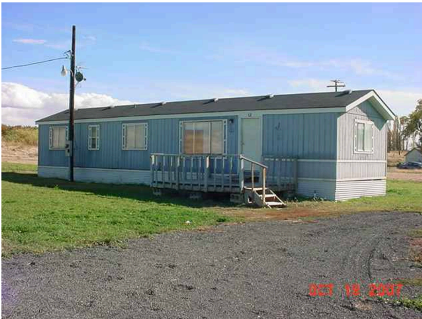
Mobile Home 1