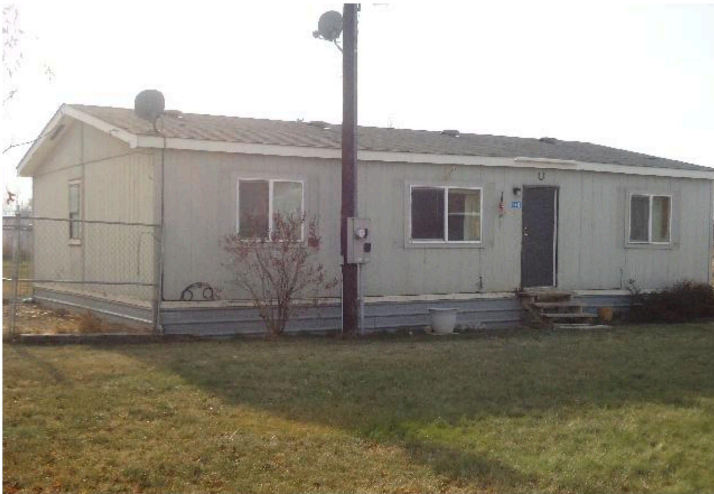
140 TREPANIER CT , WA