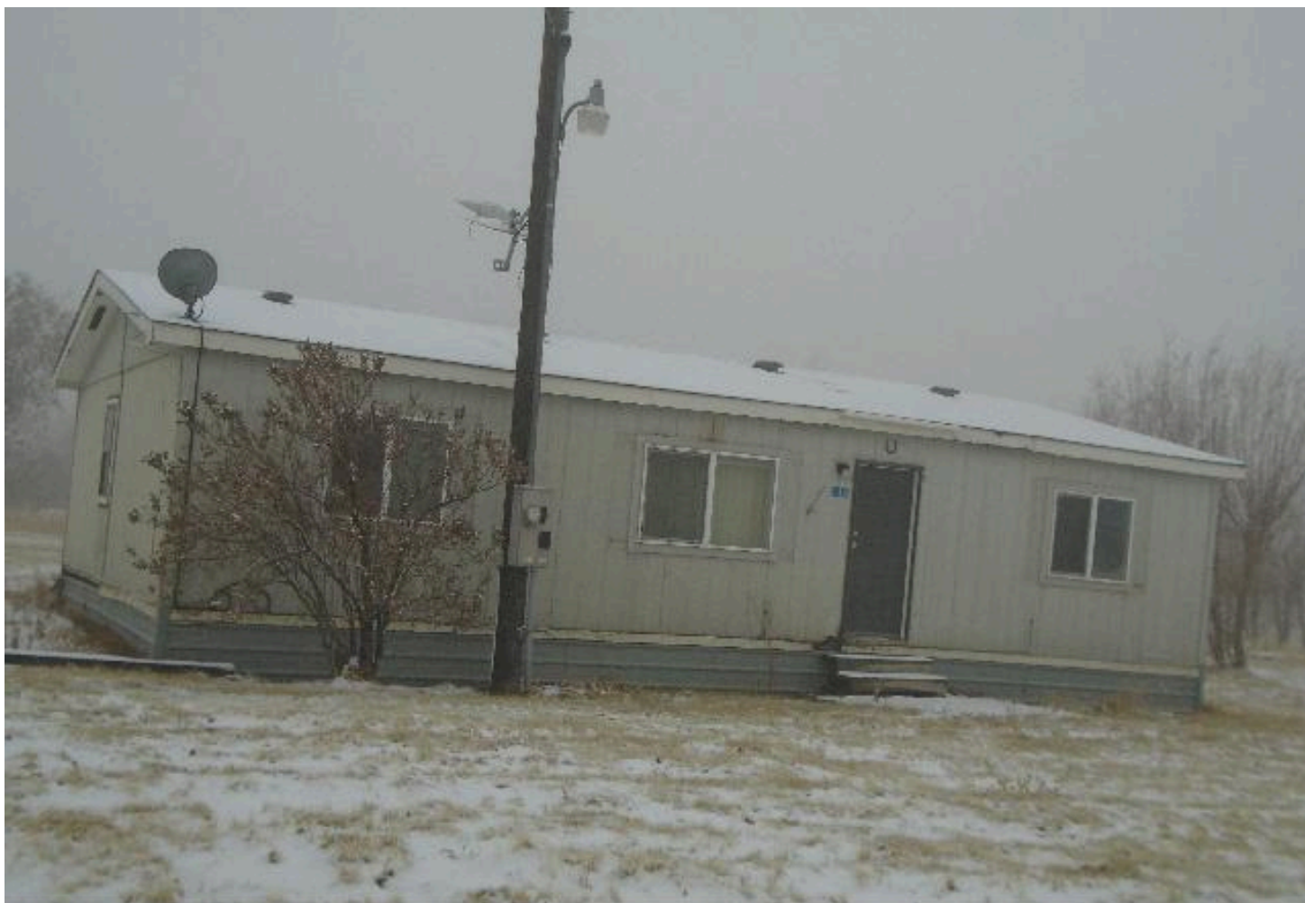
140 TREPANIER CT , WA