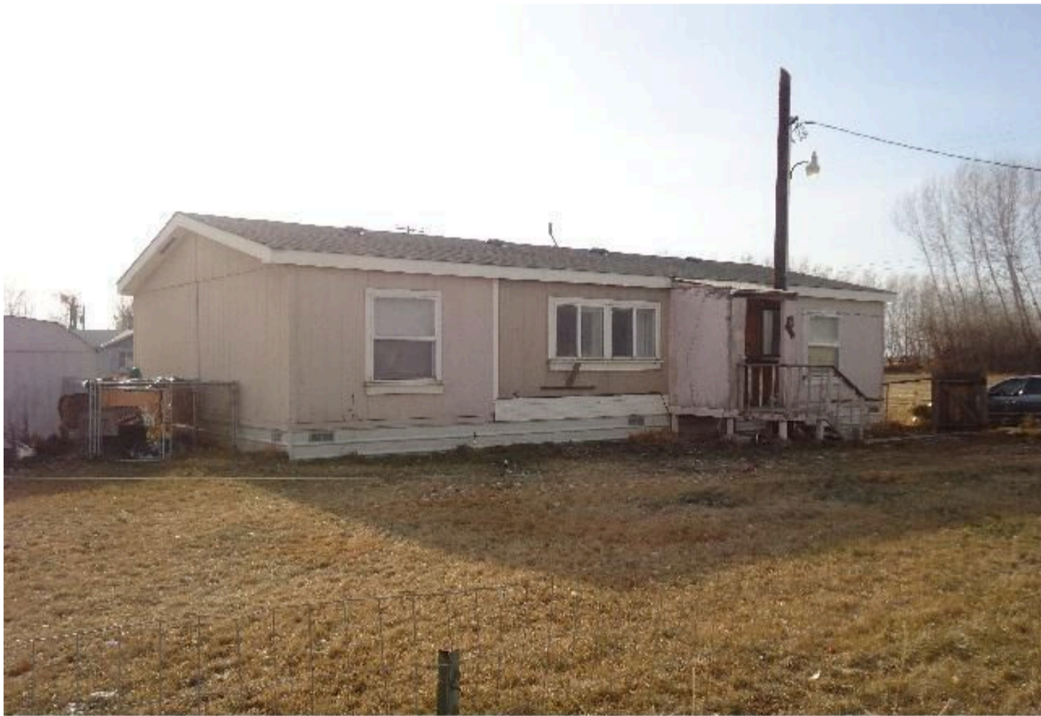
100 TREPANIER CRT COWICHE, WA 98923