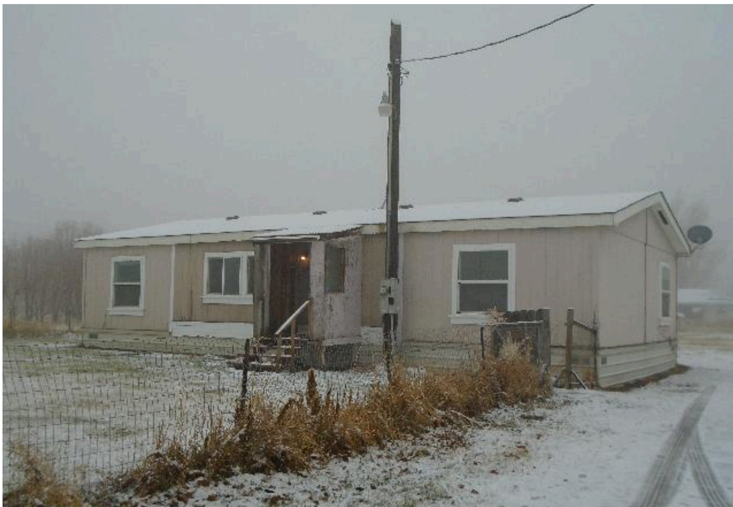
100 TREPANIER CT , WA