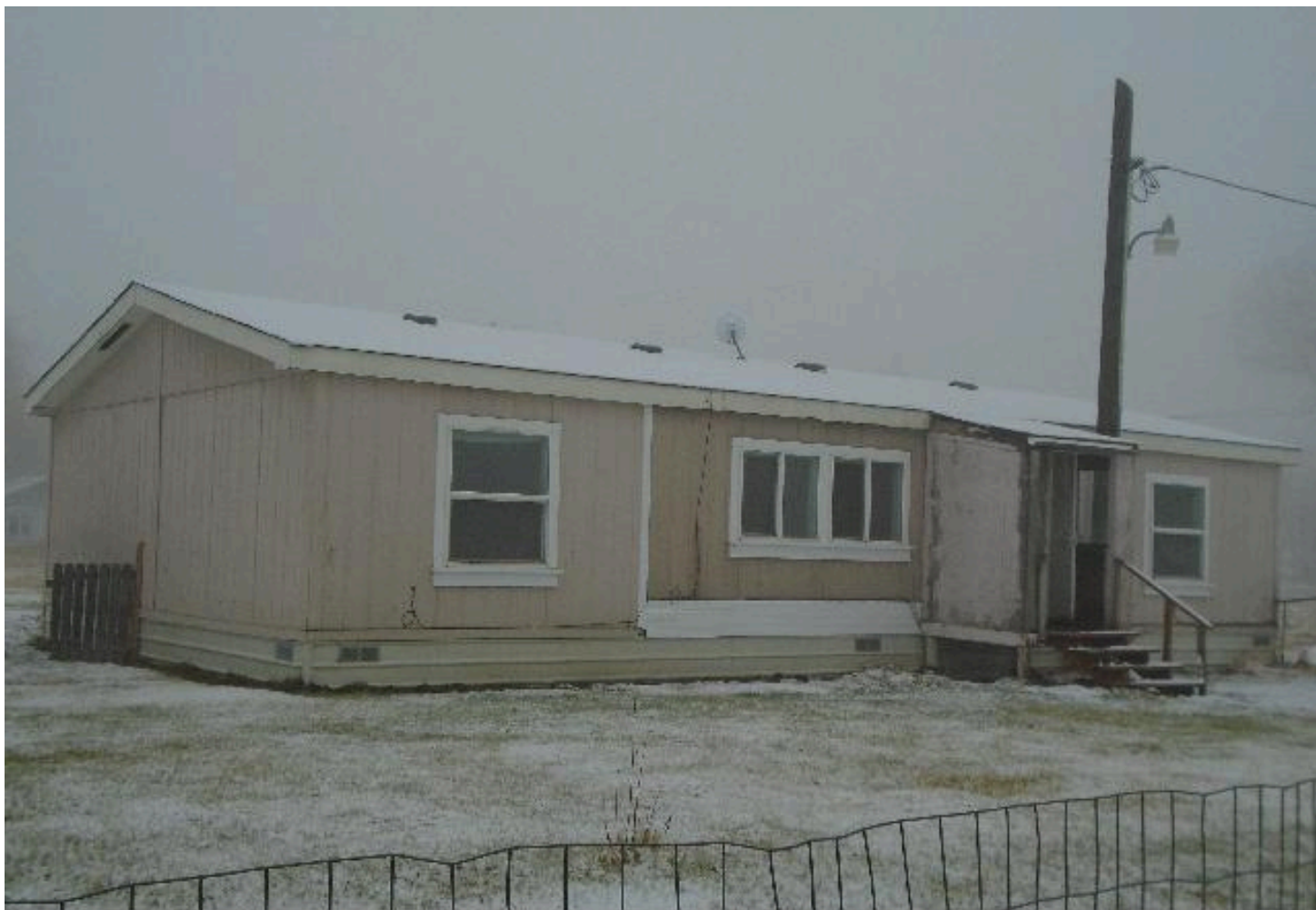
100 TREPANIER CT , WA