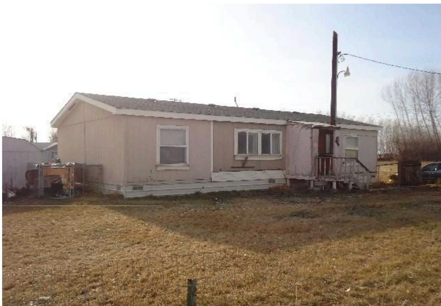
100 TREPANIER CT , WA