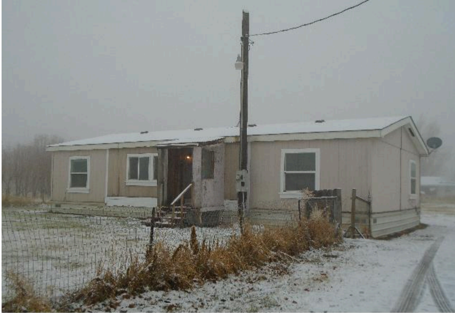
100 TREPANIER CT , WA