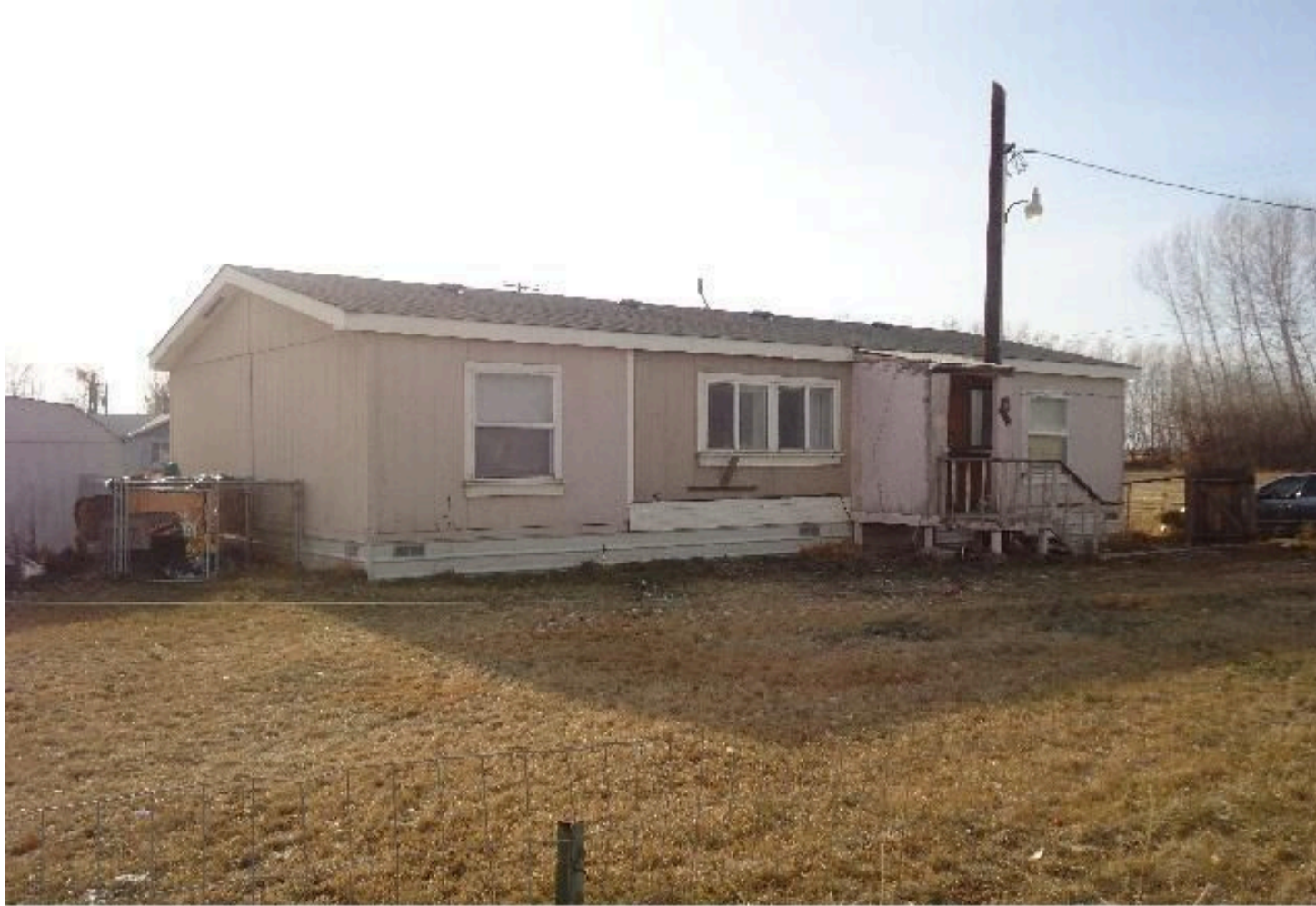
100 TREPANIER CT , WA