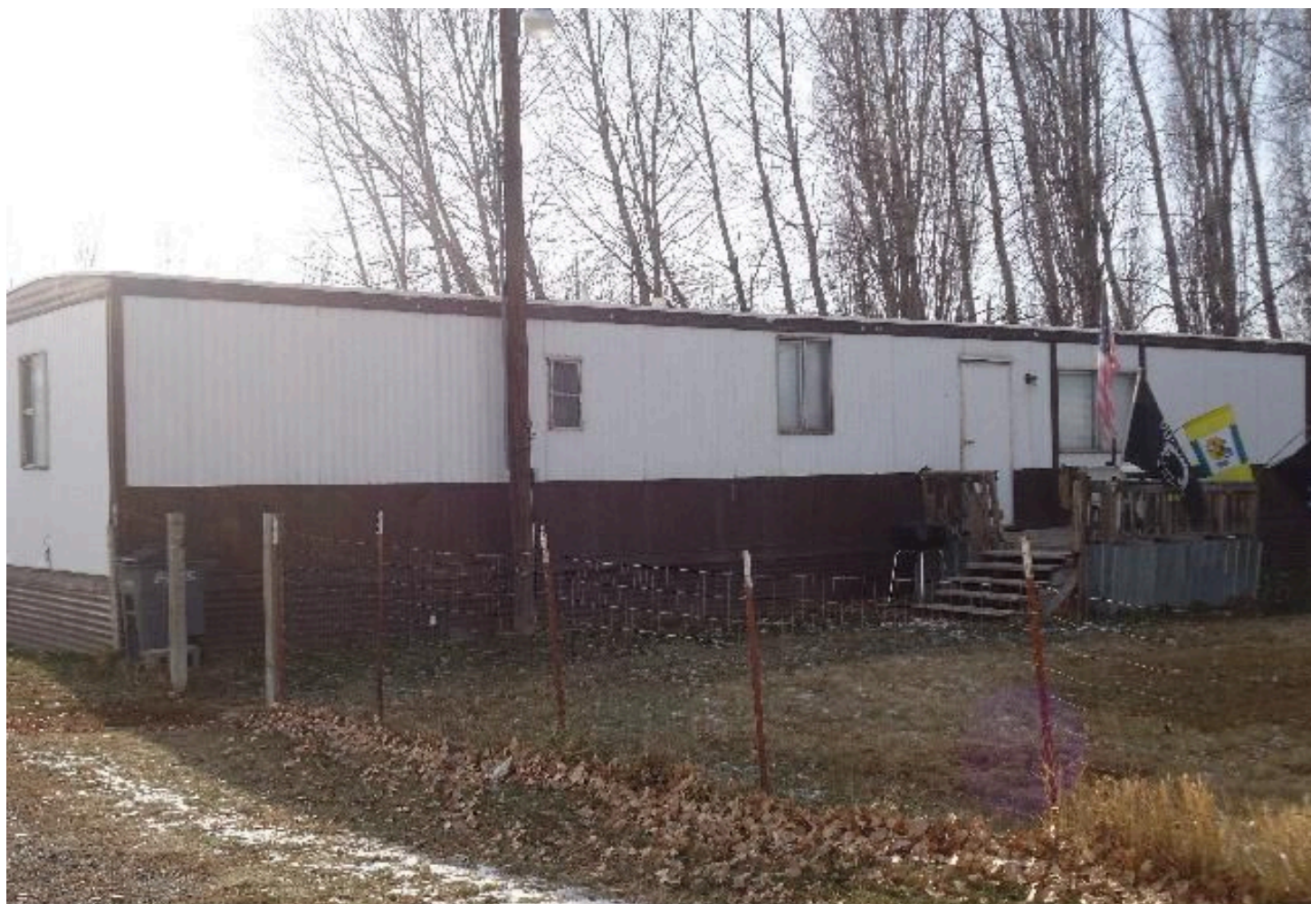
8851 NACHES HEIGHTS RD COWICHE, WA 98923-9755