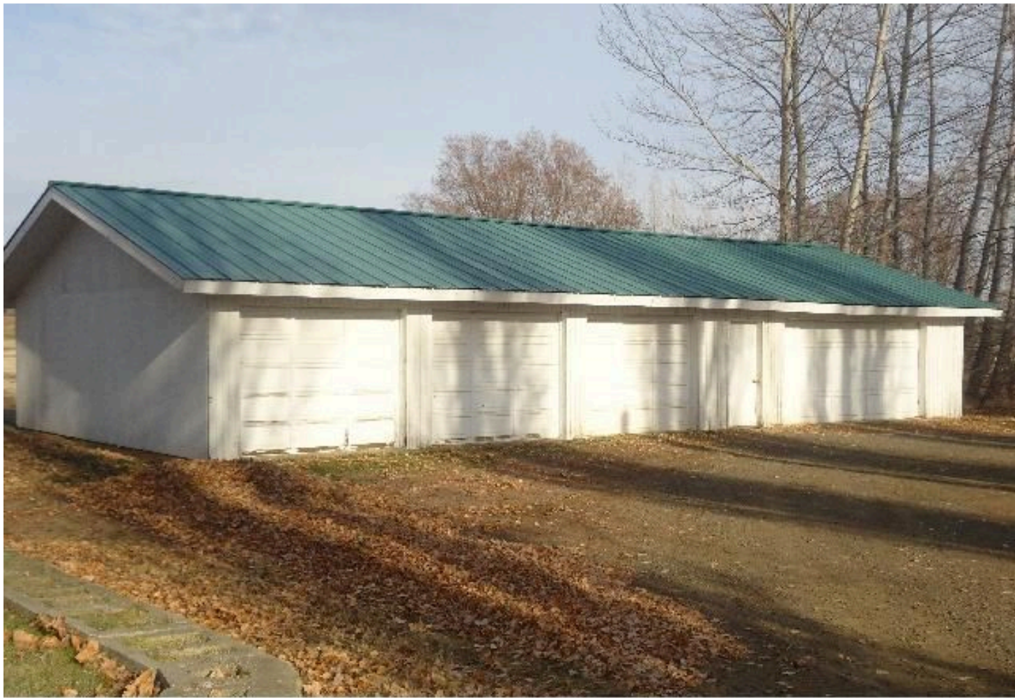
8851 NACHES HEIGHTS RD , WA