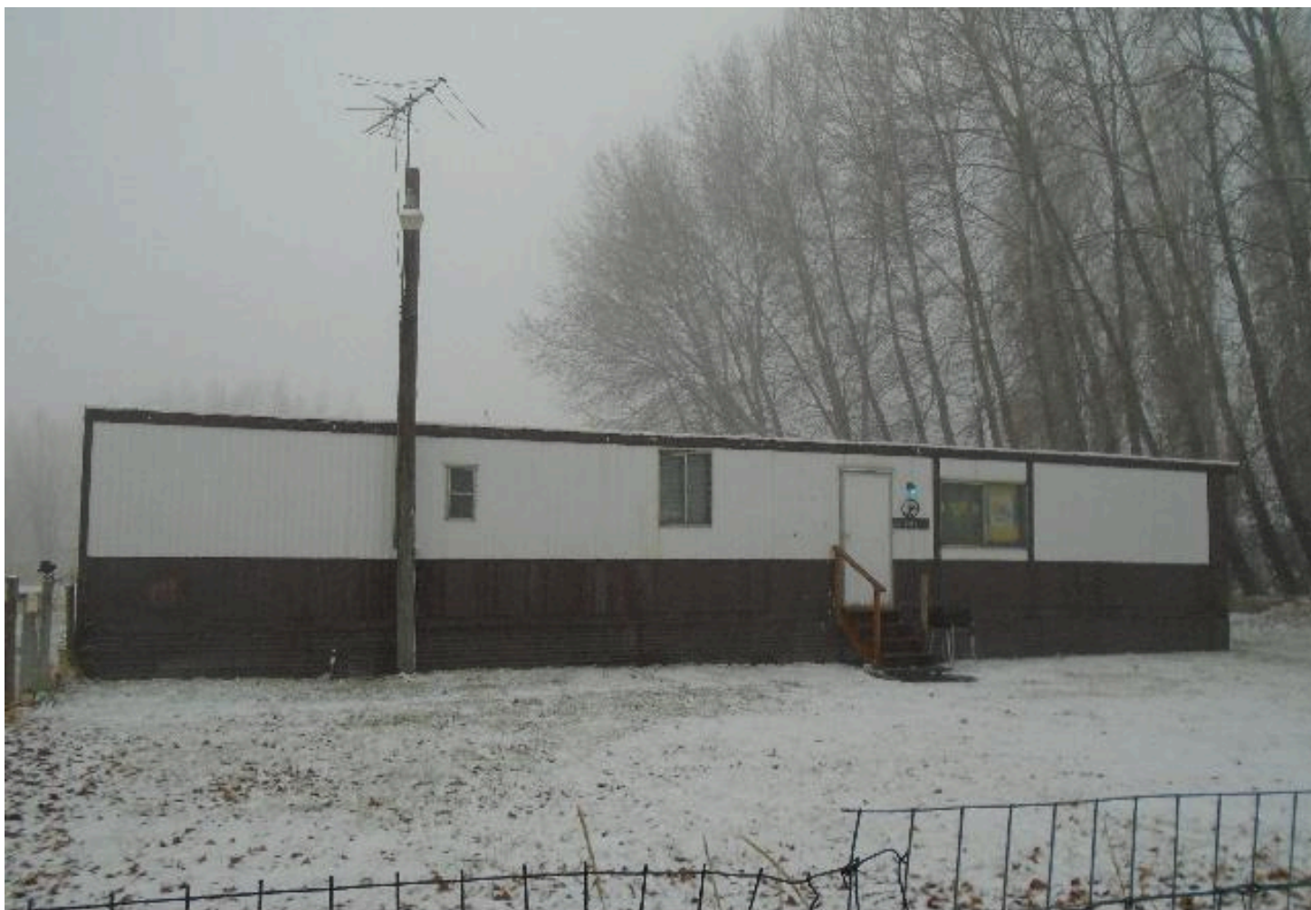
8851 NACHES HEIGHTS RD , WA