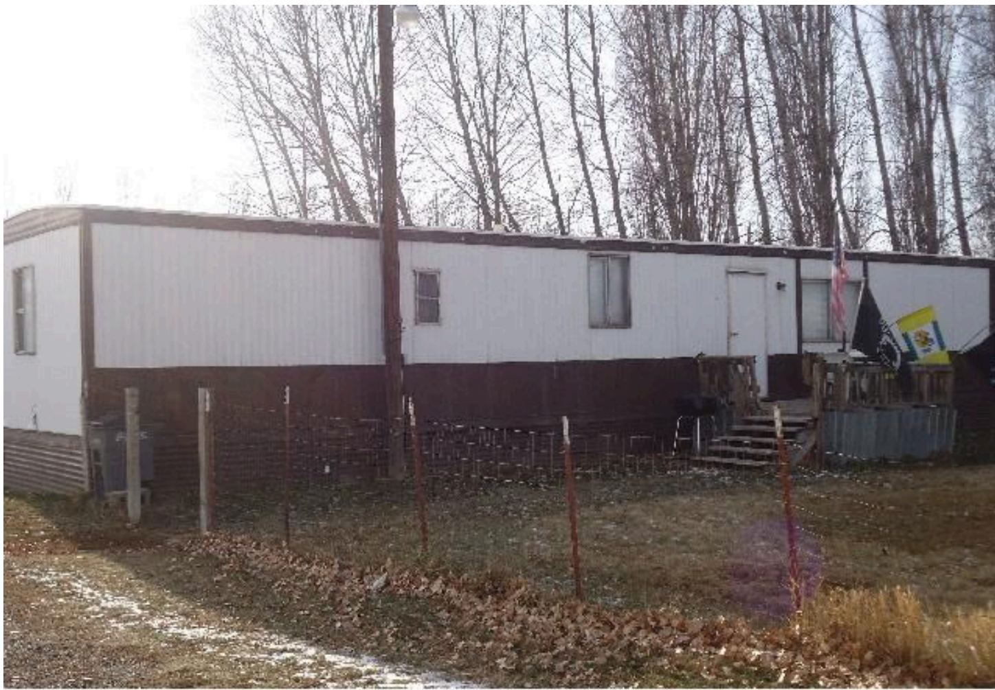
8851 NACHES HEIGHTS RD , WA