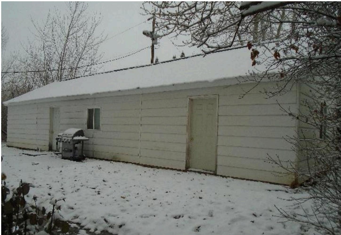
8831 NACHES HEIGHTS RD , WA