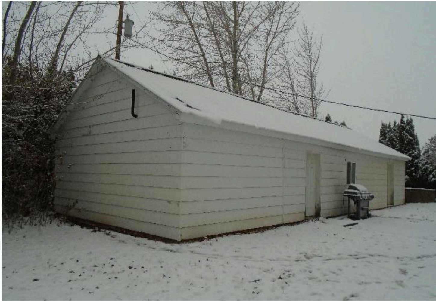
8831 NACHES HEIGHTS RD , WA