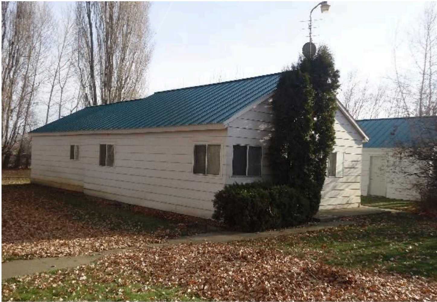
8831 NACHES HEIGHTS RD , WA