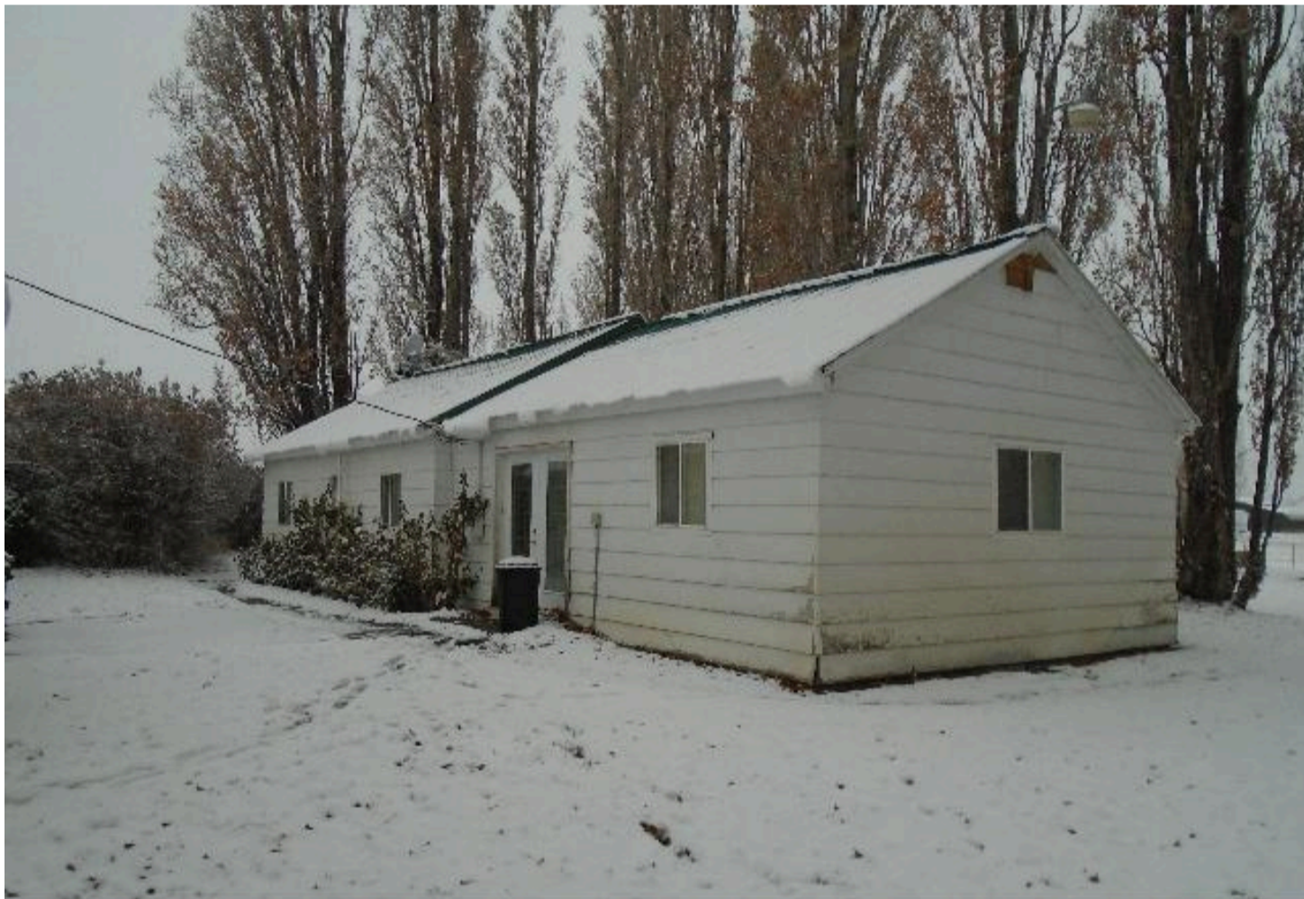
8831 NACHES HEIGHTS RD , WA