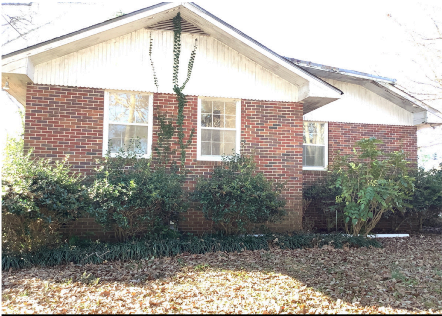
2/8/22, 10:08:06 AM 425523