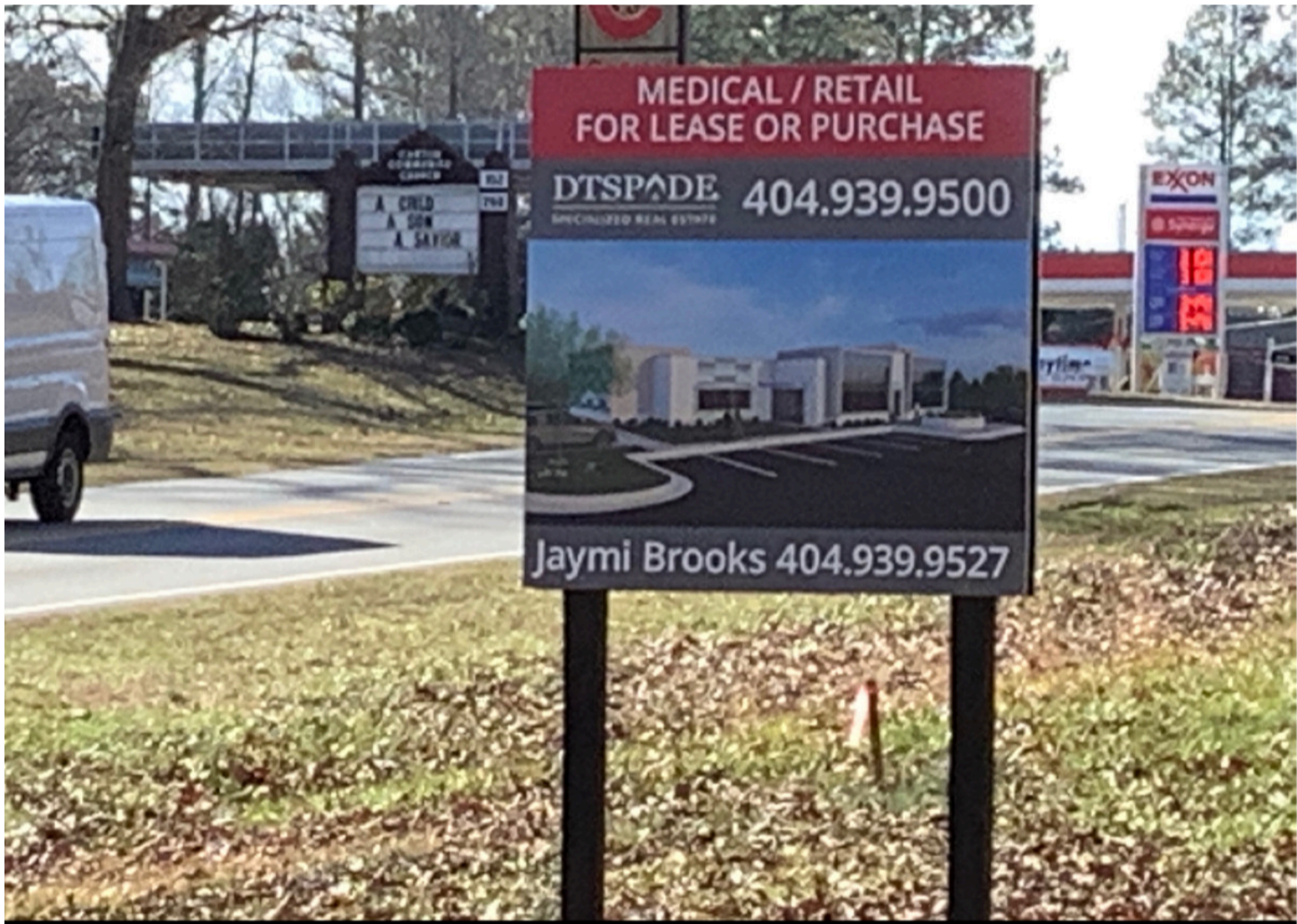
2/8/22, 10:09:23 AM 425523