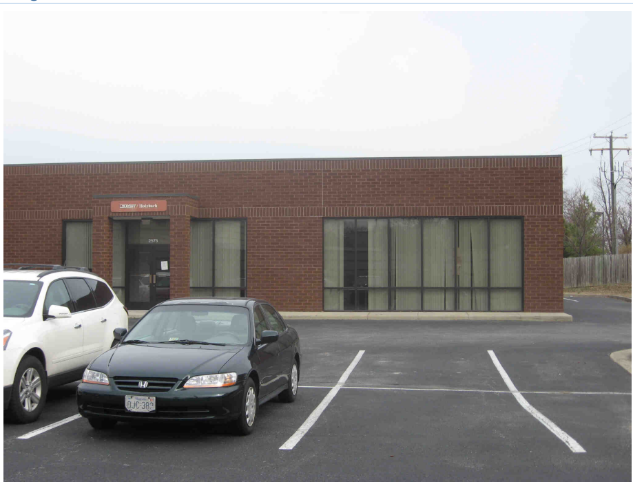
Last Photo Update 04/08/2014