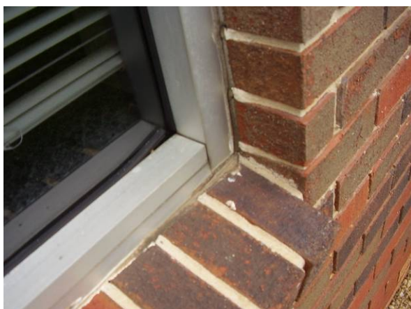
Photo #11 The window caulk located on the exterior of the building is considered an ACM.