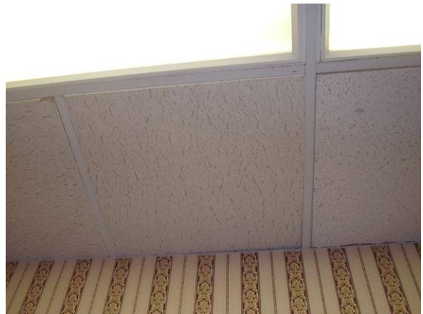
Photo #6 View of 2'x2', suspended ceiling tiles, white, pinhole, fissure, recessed.