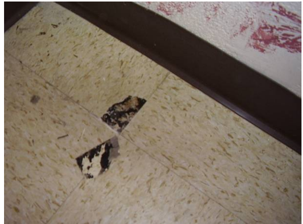
Photo #8 The 12"x12", vinyl floor tile, off white with green specks and black mastic is considered an ACM.