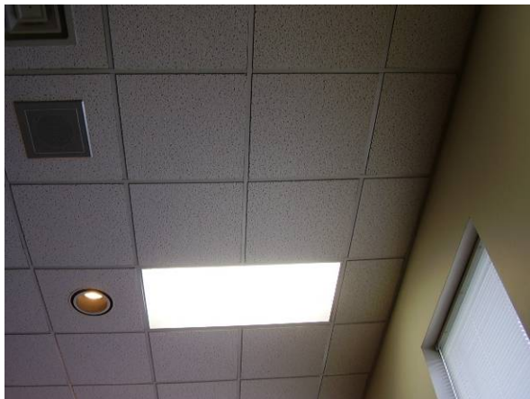
Photo #5 View of 2'x2', suspended ceiling tiles, white, pinhole, small cut, recessed.