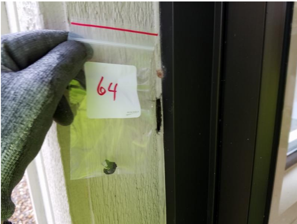
View of asbestos containing exterior window and door caulk.