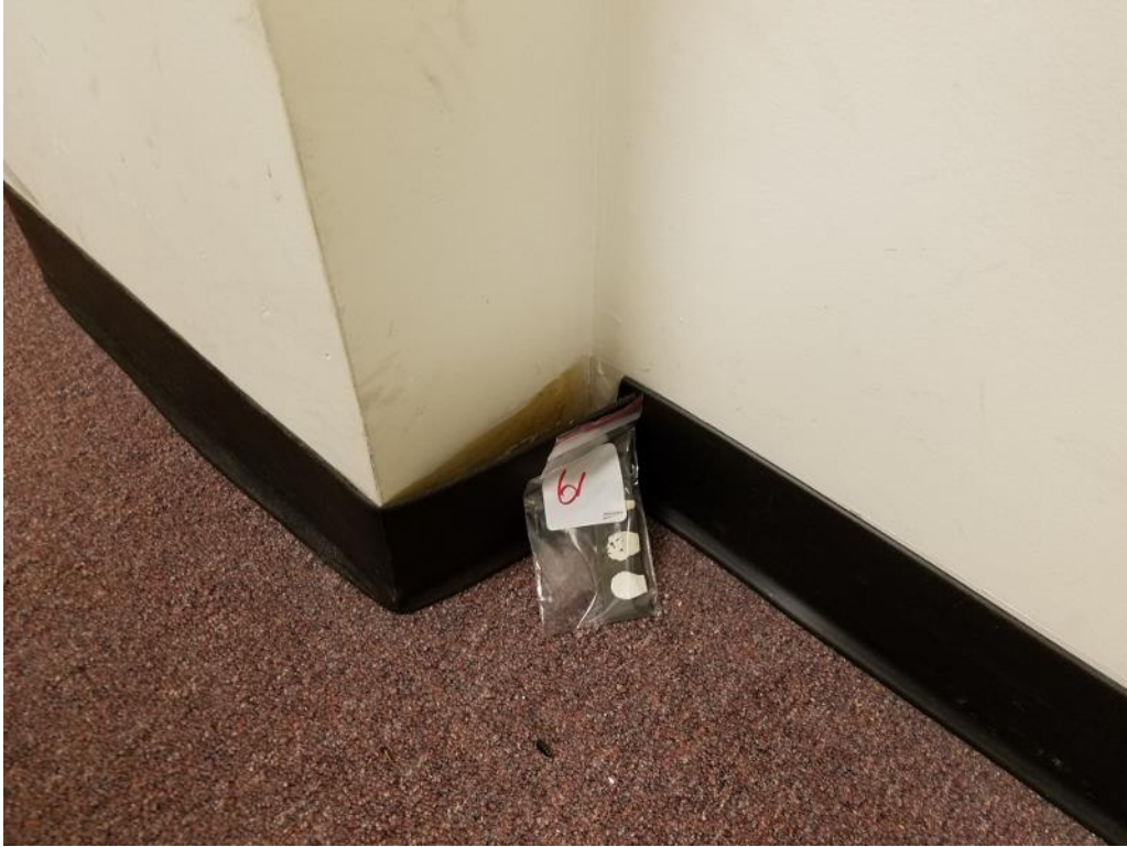
View of non-asbestos containing cove base mastic (Unit 210).