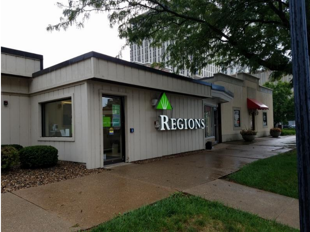
View of subject site.