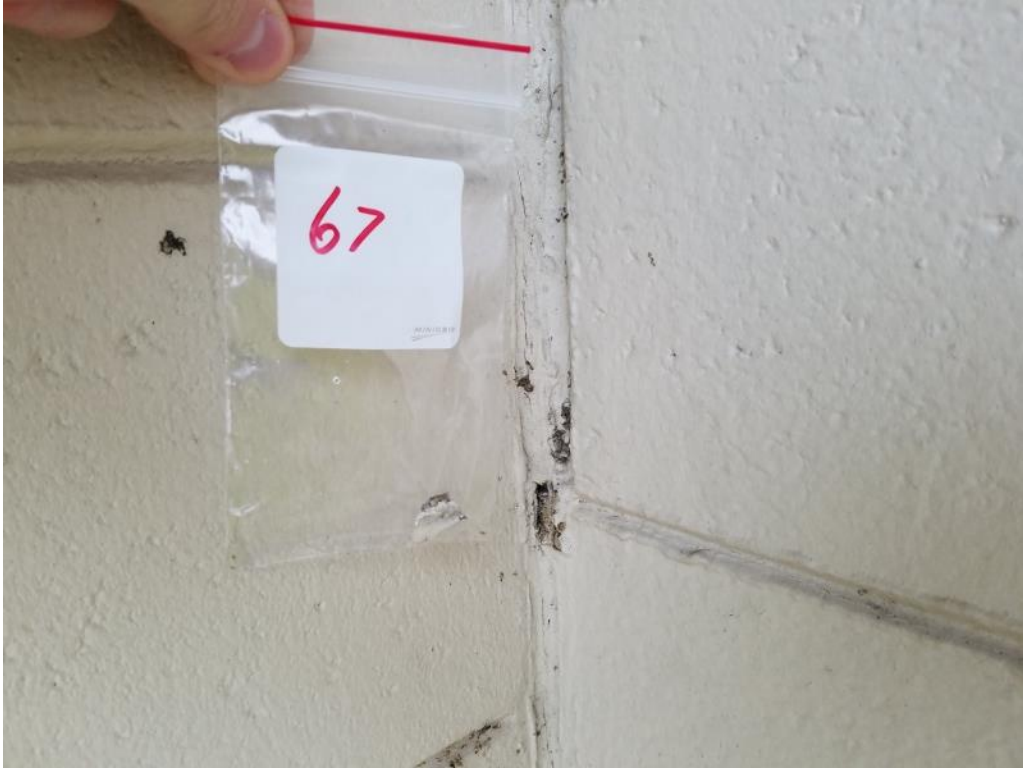
View of asbestos containing expansion joint caulk.