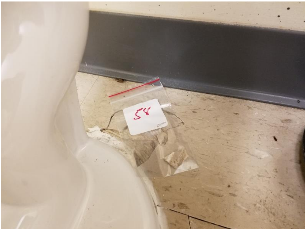
View to non-asbestos containing gray/tan 12" x 12" VFT & mastic (Unit 210 Bathroom).