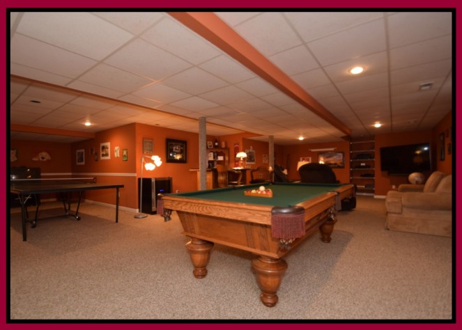
Full Finished Basement