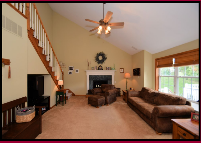
Family Room with Fireplace