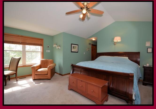
Master Bedroom with Master Bath & Walk-In Closet