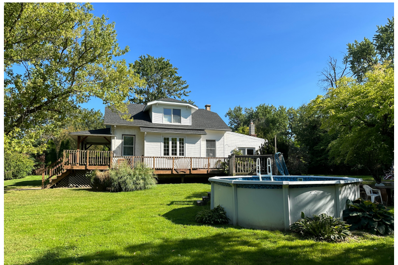
Spacious Yard with Above Ground Pool

Montgomery County North Penn School District 4 Bedrooms, 1 Bathroom Annual Tax (est.): $3,629 Year built: 1937 Sq Ft: 1,652 Public Water, Public Sewer MLS# PAMC2082994