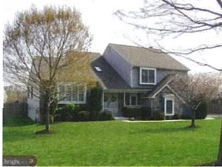
1 / 6