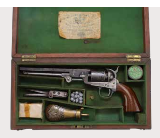
Colt London 1851 Percussion Revolver