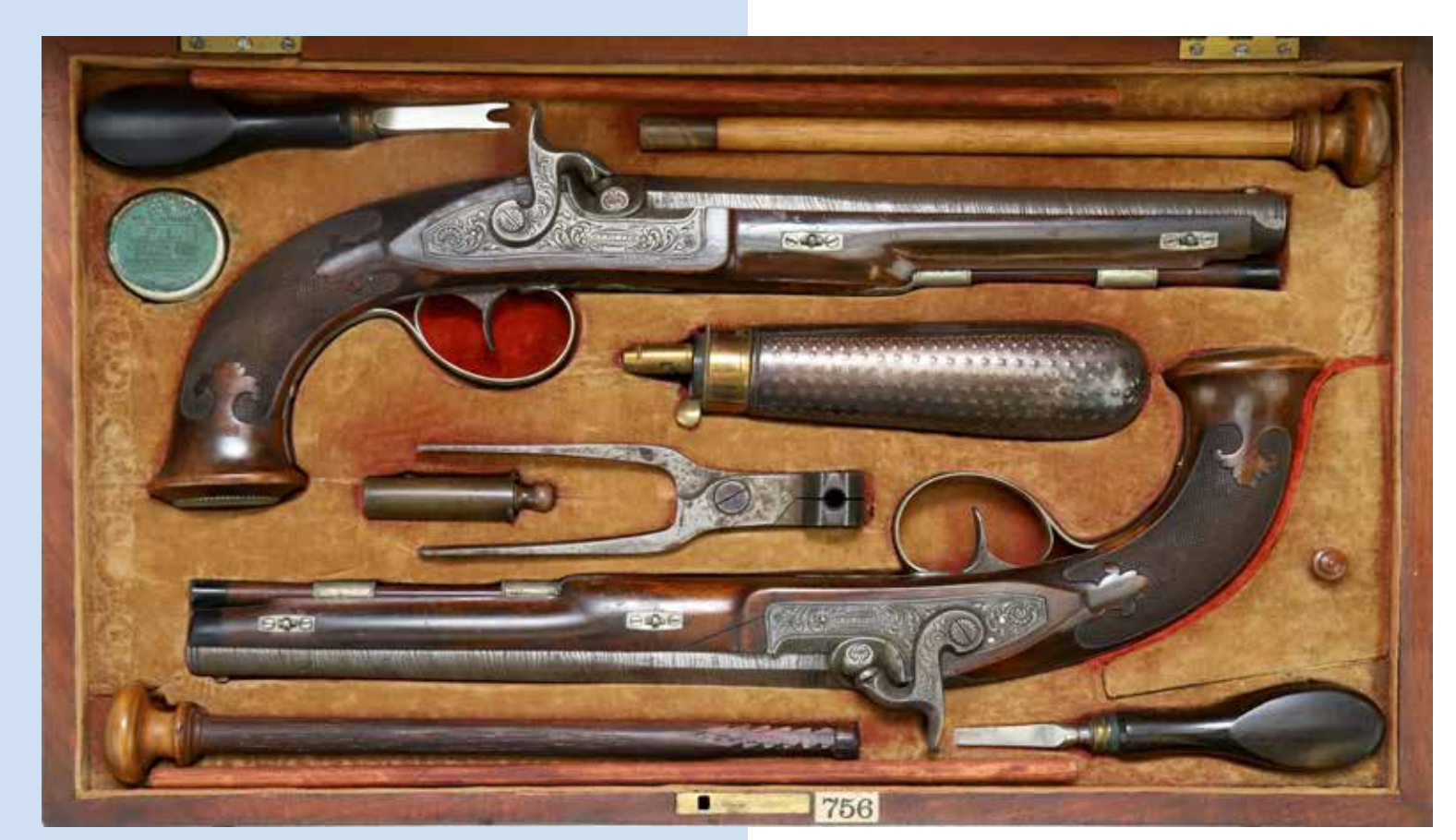
Cased Set of Kehlner Percussion Dueling Pistols

501 Fairgrounds Road Hatfield, Pennsylvania 19440 215-393-3000 AlderferAuction.com Firearms@AlderferAuction.com