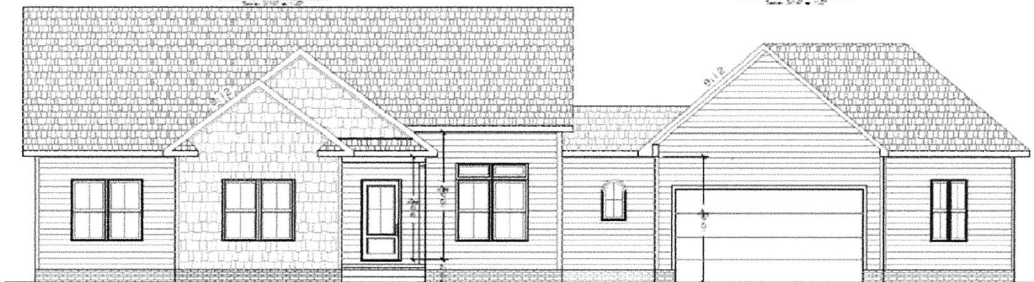
FRONT ELEVATION Scale: 1/4" = 1'-0"