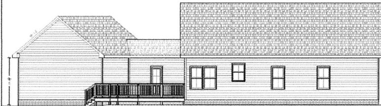
REAR ELEVATION Scale: 1/4" = 1'-0"

Note: Plans could change/alter due to code or site conditions. Designer does not assume liability for any errors or omissions on these plans. All information must be confirmed and adjusted to comply with local building codes by the contractor prior to commencement of construction.