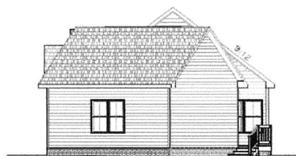
RIGHT ELEVATION Scale: 1/4" = 1'-0"